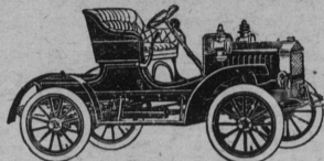
Model A-10-12 H. P., $500.