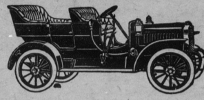
Model D-30 Horse Power, $1750.