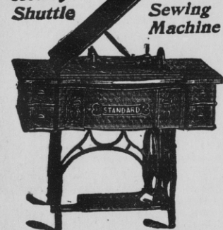
LOCK AND CHAIN STITCH. WO MACHINES IN ONE BALL BEARING STAND WHEEL

We also manufacture sewing machines that retail from $12.60 up. The "Standard" Rotary runs as silent as the tick of a watch. Makes 300 stitches while other machines make 200. Apply to our local dealer, or if there is no dealer in your town, address