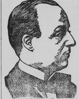
Senator Philander C. Knox.

Without an authority whatever some of the Lincoln Party adherents have been circulating reports that members of President Roosevelt's cabinet