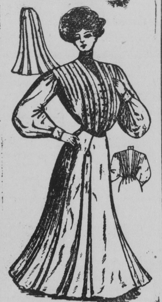
Blouse or Shirt Waist 4921, Sizes 32 to 42 bust.