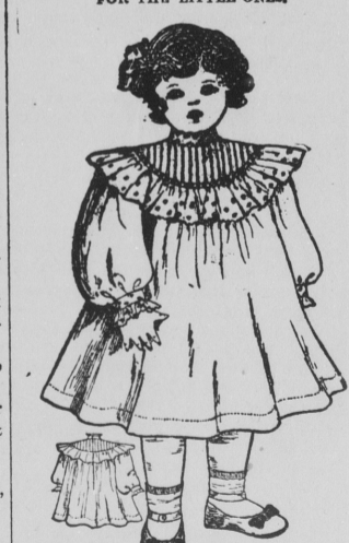
Child's Yoke Dress 4947, Sizes 6 mos., 1, 2 and 4 years.

Nothing renders a wee little girl so charming as aainty frock simply made. Illustrated is one of the very best of its kind that comes plain lawn with any yoke or tucking and full of embroidery. The material is pretty at the same time that it is durable, and the lines of the frock are all becoming to childish figures. All washable fabrics used for dresses of the sort are appropriate while the yoke can be of embroidery, inserted tucking or any other all-over that may be liked, and the frills either of embroidery or of the material. The little dress is made in one piece, gathered across upper edge and joined to the yoke, the seam being concealed by the bertha. Material required for medium size (2 years) is 2 1/2 yds. 36 inches wide with 3/4 yds. 18 inches wide for yoke. Patterns mailed by Fashion Department 10c each.