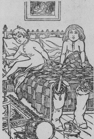
"WHAT DID HE BRING?"