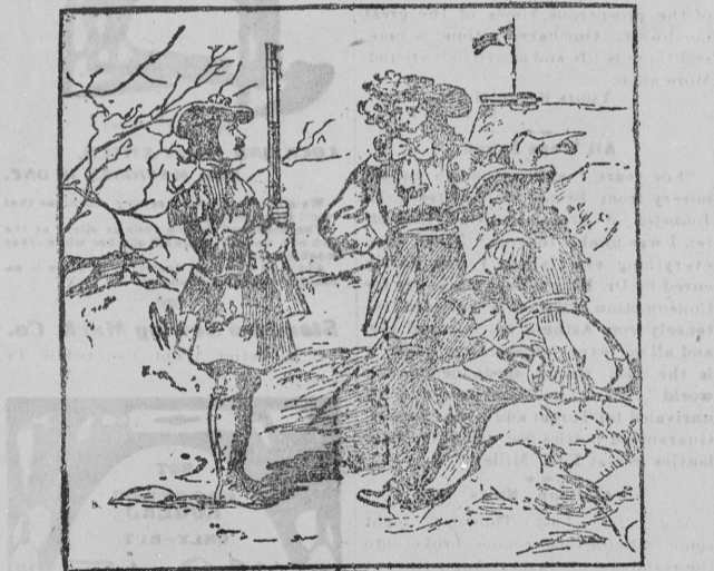
When the seizure of the Virginia Records was ordered, Governor Berkeley and Lord Culpepper were present. Find them.

threaded needle through the three pieces of cardboard. Draw the thread through and cut it off so that two inches of thread remain on each side. Knot the thread close to the arms on each side. Carry out the same plan with the trousers. Next fasten the legs to the trousers separately in the same manner. Make holes in the hands large enough to permit you tightly to insert a match. By twisting the match you can make the clown go through many interesting "monkey shines." The clown may be made of any size you desire. But if it is several inches high thin pieces of board should be used and stiff wire instead of thread.