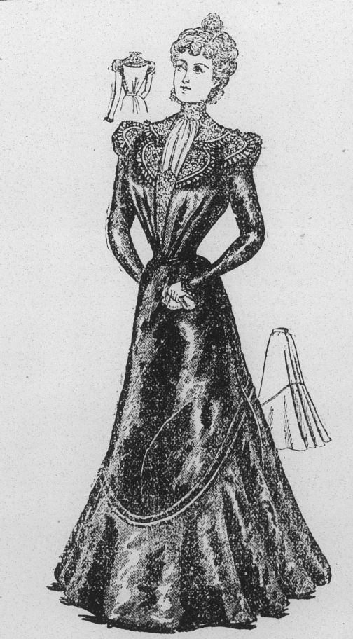
WOMAN'S AFTERNOON TOILET.

Some of the coats worn two or three winters ago can be made in style this winter if only the sleeves are cut over,