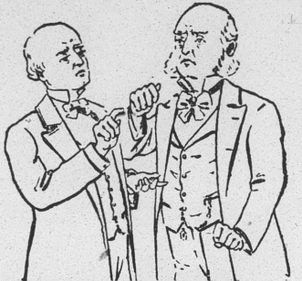
The Doctors Disagree.

From the Mountaineer, Walhalla, N. Dakota. The remorse of a guilty stomach is what a large majority of the people are suffering with to-day. Dyspepsia is a characteristic American disease and it is frequently stated that "we are a nation of dyspeptics."