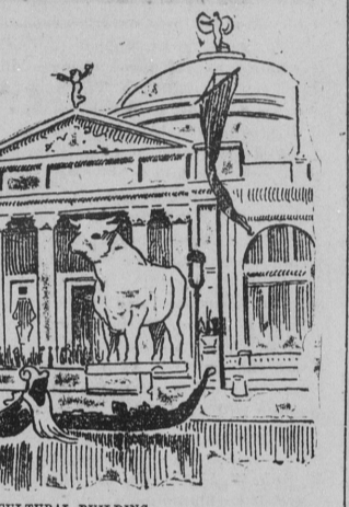
IN FRONT OF THE AGRICULTURAL BUILDING.

What is claimed as the largest sheep in the world is a "Lincoln," a breed which somewhat resembles the Cotswold. He is five years old, weighs 437 pounds without his canvas vest, and when he was last sheared yielded twenty-two and one-quarter pounds of wool. Two breeders of Shetland ponies maintain a permanent exhibit of the stock in this building. These firms confine themselves entirely to the raising of toy horses. They show about fifty Shetlands of all colors and sizes, notably one of the black stallion named "Banjo" and over half dozen named "Banjo" and over half dozen named "Banjo". These ponies are small, but they are very hardy and they are very good for riding. They are very good for riding. They are very good for riding. They are very good for riding.