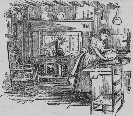
"BREAD WITHOUT YEAST—THE MOST PERFECT OF ALL CONCEIVABLE WAYS OF RAISING IT."

The fermentation of the dough, which fills the dough with germs and filth, and without the long period during which the raising process goes on, the gain in food and the gain in the avoidance of the germs is exceedingly plain.