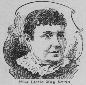
After the Grip

Nervous Prostration --- No. Help Except in Hood's