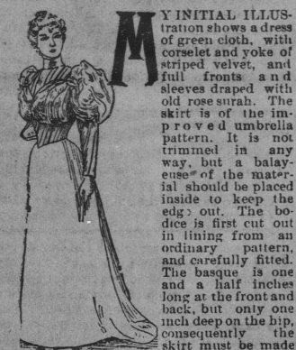
A STYLISH BLOUSE.

Gowns for House Wear. The Styles and Makes of Seasonable Garments.