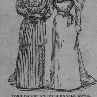
LONG JACKET AND FASHIONABLE GOWN.

and eyes down the middle. Then the yoke is carefully planned out to them.