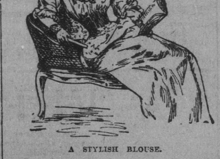
A STYLISH BLOUSE.

A MOTHER AND TWO DAUGHTERS SERIOUSLY ILL FROM TASTING POISON IVY BUDS.