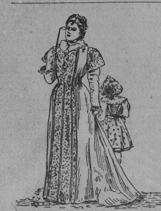
A TEA GOWN.

ought to be of very good quality, as otherwise it will not drape well.