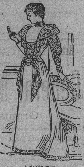
A MINNER DRESS.

Full styles are set before you in the picture. The figure on the left displays a Russian blouse over a dress of apricot silk.