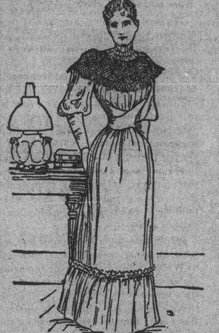
A CHARMING NOVELTY FOR THE YOUNG.

Full styles are set before you in the picture. The figure on the left displays a Russian blouse over a dress of apricot silk.