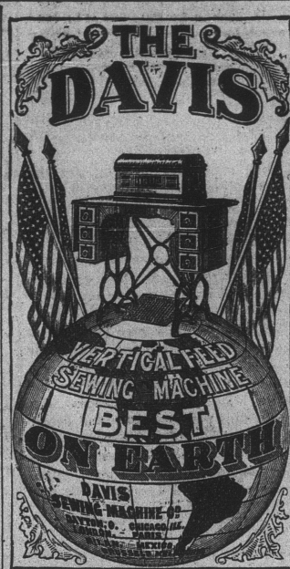
NEW SHOPS OF DAVIS SEWING MACHINE CO.

Passengers to Lawrence via the Essex branch of the Eastern Division of the Boston and Maine railroad may see, in