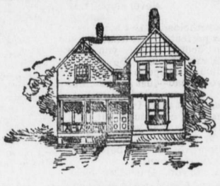
A SUBURBAN COTTAGE. A SUBDRAN COLLARS. No. 5. New piece Michigan white pine, soft and clear, broke short at a weight of 1.610 pounds. No. 6. New piece Michigan oak broke nearly short off at a weight of 2,428 pounds.

woods. The timber tested way subjected to an actual breaking, on stick- 2x4 inches and four feet long, to centers, being one-fourth as long, thick and wide as an acfour feet long, to centers, being one-fourth as long, thick and wide as an ac-tual stringer as used by the railroad company in their trestile bridges. The test is important, as there seems to have been but little information on that sub-ject, and the impression has been that ordinary oak was stronger than fir. The test show, however, that yellow fir is actually one-third stronger than eastern oak, and more than one-half stronger than eastern white pine. The breaking weight, placed squarely in the middle of each stick, was as follows: No. 1. Old plece of yellow fir from yard, having docayed ends, six years in the weather, 3,063 pounds. No. 2. New soft plece fine grain yellow fir, similar to the best flooring timber, 3,029 pounds. No. 3. Old plece yellow fir, coarse grain and hard, broke short at 4,320 pounds. No. 4. New plece from the butt of tree, coarse grain, broke with a stringy frac-ture at 3,635 pounds.