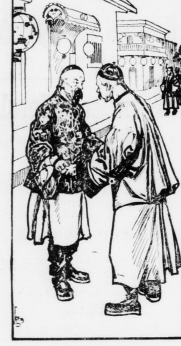
"KUNG SHI, KUNG SHI!" quiet as if it was an ideal Sabbath of

Long before all these ceremonies are early hours of New Year's morning the streets look as deserted as if no one