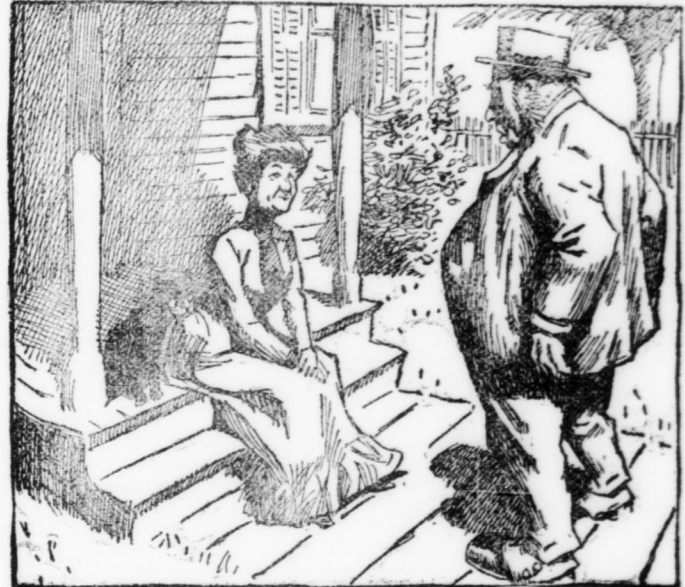
"WELL, DID YOU FIND PARADISE?" SHE ASKED.

"I think it's a fraud," she replied. wouldn't have your suspicious nature for any money. What's wrong about front of the steps.