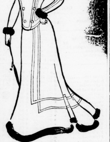
FOR TRIMMED COSTUME. though perhaps short, stout figures will not be improved by the baggy effect produced.

The little, short boleros, with a watteau plait at the back, are the newest fashion, and very smart they look.