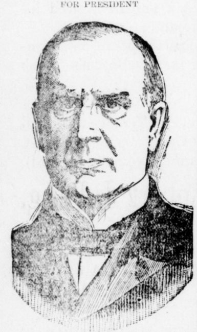
WILLIAM MCKINLEY, of Ohio.