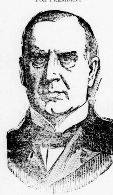
WILLIAM M'KINLEY, of Ohio