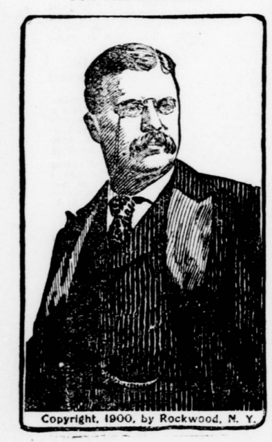
THEODORE ROSEVELT, of New York