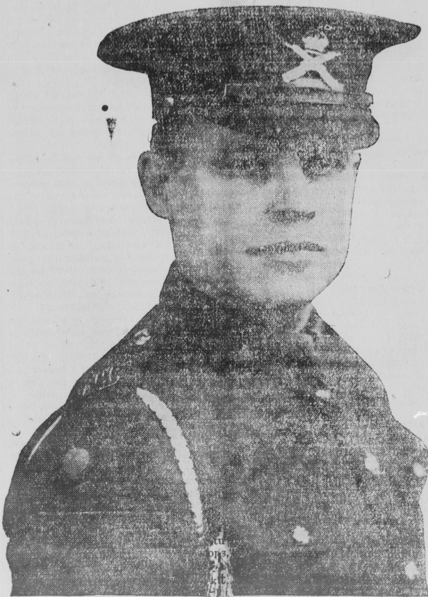
Sergt. Arthur Guy Empey in photograph's master production.

Admission, Children 25 cents; Adults 40 cents.