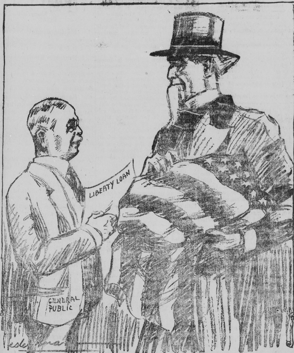
"How Long Would It Take to Get the Kaiser—"

By the Honor Flag of the Third Liberty Loan we will know the patriots of the nations—the individual patriots, the town, city or county patriots, the state patriots. The community over which the Honor Flag flies first will be the community which has first loaned to Uncle Sam all he has asked to borrow from that community to carry on the war for the freedom of the world. The specially designed Honor Flag shown in the picture will be awarded to every community to which a quota has been assigned as soon as that community has attained that quota. Then each subscriber in that community will get a small poster for home window display containing a reproduction of the Honor Flag and a blank for the name of the subscriber. In each community to which a quota has been assigned a large honor roll will be posted as conspicuously as possible at the top of which will be a