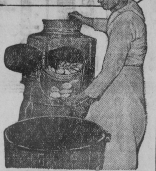
How They Peel Potatoes aboard Ship

tatoes in America for greater use in every home and for all needs of army and navy. Eat more potatoes, eat less wheat.