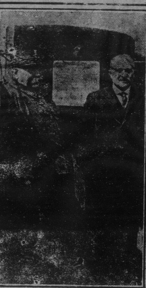
General Joffre and Ex-Premier Viviani.