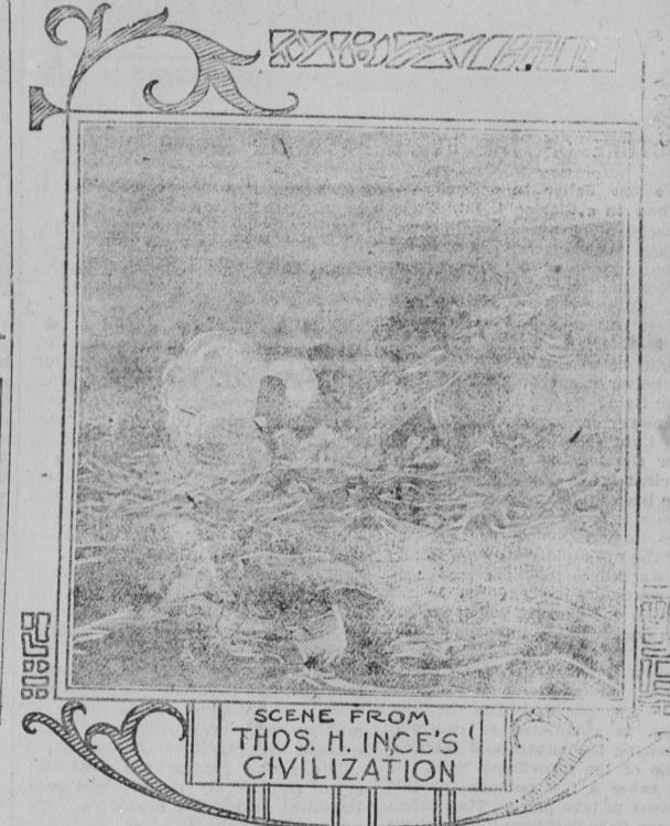
SCENE FROM THOS. H. INCE'S CIVILIZATION

Miller & Collins Department Store, Myersdale, Penna.