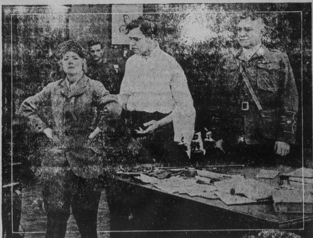
BESSIE BARRISCALE AND CHARLES RAY IN TRIANGLE-KAY BEE PLAY, "A CORNER IN COLLEENS."

TWO PART KEYSTONE COMEDY-TRAVEL PICTURE 2 BIG SHOWS 2 ADMISSION 5, 10, and 15 cents