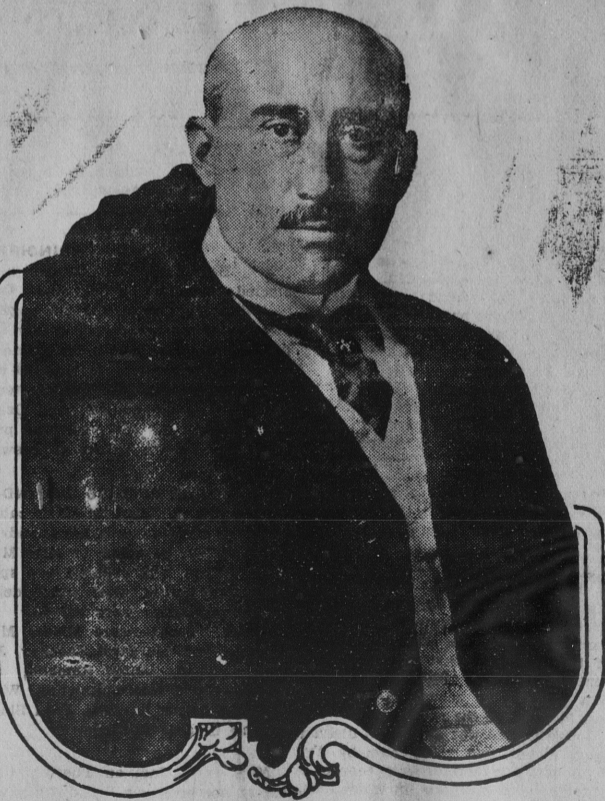
JOHN KENDRICK BANGS.

ONE of the most popular lecturers of the present day as well as a noted humorous writer and editor is John Kendrick Bangs, who will be heard here on the seventh afternoon of the Chautauqua. He has been in turn editor of Literature, Harper's Weekly and the Metropolitan Magazine and was at one time managing editor of Life. His humorous writings include more than fifty volumes of prose and verse. "More Salubrities," the title of Mr. Bangs' lecture at the Chautauqua, is a continuation of his notable platform effort "Salubrities I Have Met," which is a lively running talk about more or less famous men and women met by the lecturer in the course of his career. "More Salubrities" is as delightfully humorous as his former masterpiece and introduces new characters and new incidents.