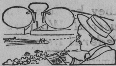
You Can See Near and Far with the Same Lenses.