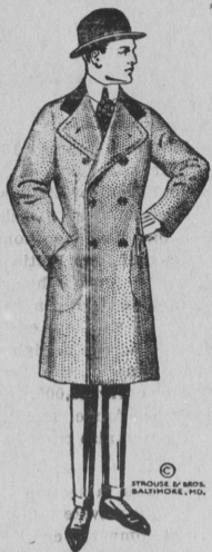
ONE OF MANY HIGH ART MODELS—SUITS TOO

For correctness of style, for brilliance of fabric colorings and weaves—for dependability at all times—your clothes are HIGH ART STYLE CLOTHES.