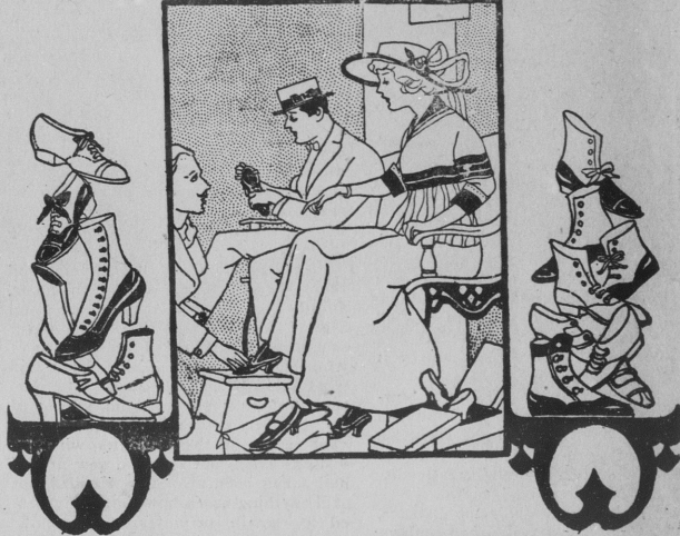
Shoes of Comfort That Wear.

Patent leather and enamel shoes in all sizes with fashionably shaped toes.