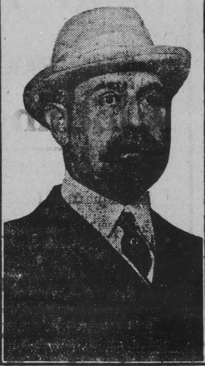
FREDERICO ALFONSO PEZET, Minister in Washington from Peru.