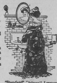
"Standard" "Schwinn" Lavatory

Bathe for health in a "Standard" modern bathroom such as we install—always with the customer's satisfaction in mind. We know how to do satisfactory work. Confirm our statement by calling on us.