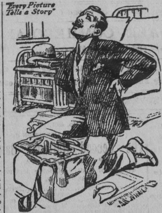
"I can hardly straighten up."

The network of nerves in your body, like the network of wires in a burglar alarm system, gives quick warning when anything is going wrong inside. Looking at it in this way a pain is a useful alarm. Now, kidney weakness is a dangerous thing—a condition not to be neglected—and it is wise to know and pay attention to the early alarm signals of sick kidneys.