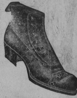
$3.00 Men's Dress Shoes, $1.95

THE UNDERSELLING STORE, Next to Donges' Meat Market, MEYERSDALE, PA.