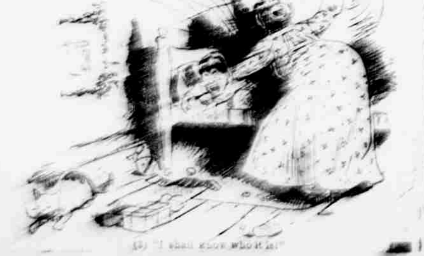
Don't fool with Santa Claus.