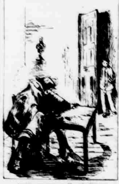
A MESSENGER BOY ENTERED.