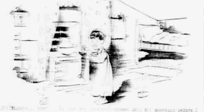
Don't fool with Santa Claus.