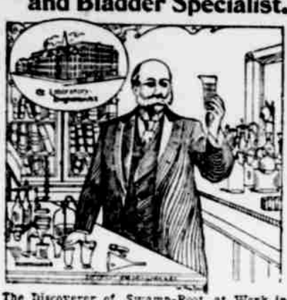
The Discoverer of Swamp-Root at Work in His Laboratory.

There is a disease prevailing in this country most dangerous because so deceptive. Many sudden deaths are caused by it—heart disease, pneumonia, heart failure or apoplexy are often the result of kidney disease.