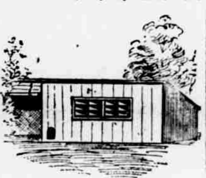
A USEFUL HENHOUSE.

The following considerations for the comfort of fowls and the convenience of their caretaker should always be observed in the construction of a good henhouse. In their natural state fowls do not breed in large flocks, and they never lay well in large flocks.