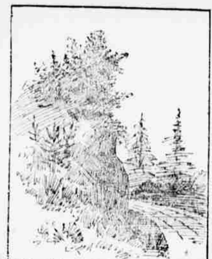
HOW IT SHOULD LOOK

man emphasize the concluding sentence to kill time.