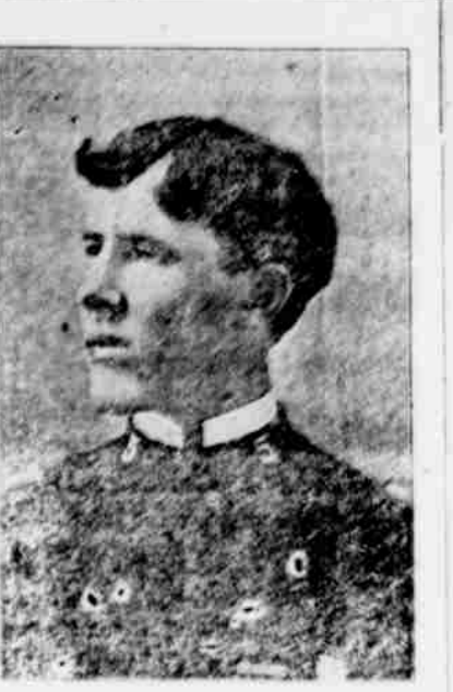
SHERIFF H. S. TAYLOR of Centre County who took great risk in leading capturing party and subduing four notorious burglars.