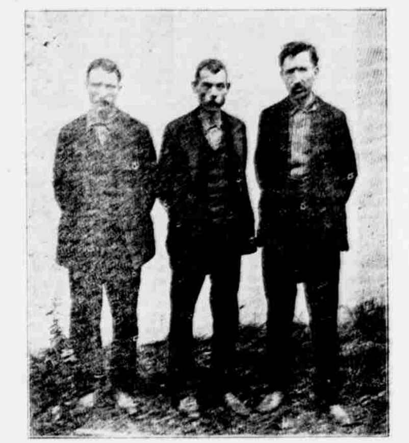
THE THREE ROBBERIES STANDING IN ORDER, AS THEY SURRENDERED.