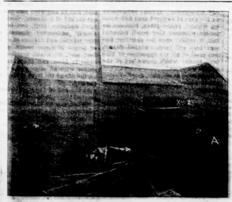
FAUST'S BARN IN SEVEN MOUNTAINS WHERE THE MEN WERE SEIZED.