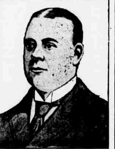
GEORGE P. WETMORE. (Junior United States Senator from Rhode Island.)

Hon. George Peabody Wetmore is sure of a seat in the United States senate from Rhode Island until 1906. He happened to be born in England while his parents were there on a European trip. He was graduated from Yale in 1867, and from the Columbia law school two years later. He was