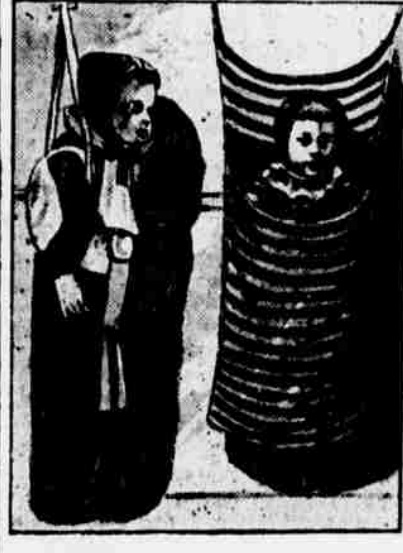
WHEN MAMMA GOES OUT. (Children Suspended from Ceiling or Wall by French Mothers.)

When they are obliged to leave their infants alone for an hour or so they never fail to place them out of harm's way by hanging them either from the ceiling or from one of the walls of the room. They have a rope with a loop for this purpose, and all they