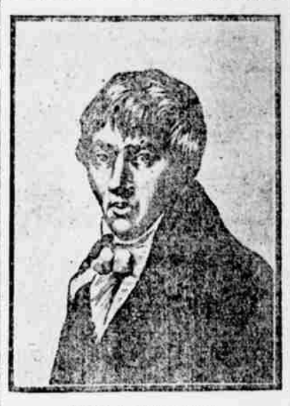
(His Name Will Aiway» He Associated with Road-Making.)

This is, perhaps, the most perfect eximple of all of a spontaneous popular impulse whereby an inventor, who had benefited mankind, was embalmed, so to say, in his own invention, and his