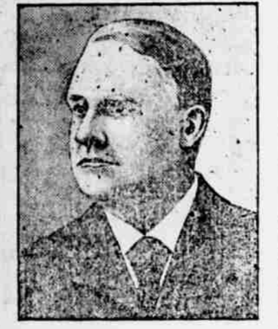
STEPHEN B. ELKINS. (West Virginia G. A. R. Man Question His War Record.)