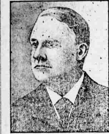
STEPHEN B. ELKINS. (West Virginia G. A. R. Man Question His War Record.)