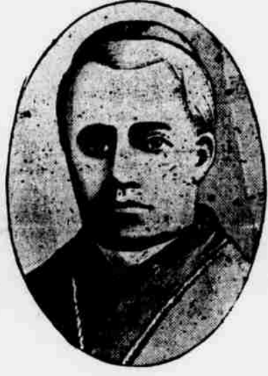
CARDINAL GIUSEPPE SARTO (Pope Leo Wants Him to Be His Successor in the Papacy.)

The cardinal is recognized as one of the most learned men of the church. He is a stickler for the exact truth as between the church and the people, and won much renown some years ago by destroying certain relics of doubtful authenticity. He would, it is pointed out, bring to his high office a character of most attractive modesty, unusual energy in the direction of matters large and small, and the talents of a fine administrator.