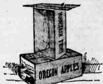
NEAT BOXES FOR APPLES.

A typical box is shown here which represents the thought and experience of apple shippers on the Pacific coast. Every part of it appears to have been carefully studied, and it certainly answers the purpose well. The inside dimensions are 20 1/2 x 11 x 9 1/2 inches. This makes a cubic content of a trifle over an even bushel, and about six quarts less than a heaping bushel. The ends are three-fourths-inch material, and all four sides are one-fourth-inch hard pine. There is no partition, as in the orange box. The apples may be put in tightly, and the thin springy sides hold them without bruising. The box is put together with 32 rough wire nails 1 1/2 inches long. The chief advantages of this package are: Con-