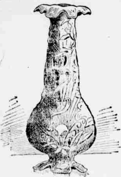
VASE FOR PRINCESS IRENE. (Presented to Prince Henry's Wife by Chicago Ladies.)

A handsome silver vase, two feet high, with a gold lining, was the present which the wives of the members of the Germania club of Chicago made to Princess Irene, wife of Prince Henry, through the courtesies of the prince while in that city. After it has been admired for a few days at the Germania club it will be packed up and