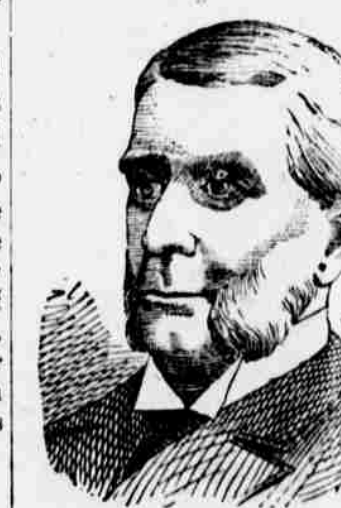
WILLIAM D. WASHBURN (New Head of the National Organization of Universalists.)

William Drew Washburn, of Minnesota, who has just been elected president of the Universalist general convention by the delegates at Minneapolis, is one of the wealthiest managers in America and a well-known citizen of Minneapolis, where his flour mills are located. Mr. Washburn has participated in political life since 1861, when he was appointed States surveyor general of Minnesota. He was subsequently elected Congress for three terms, and in 1880