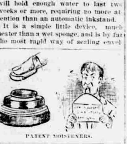
PATENT MOISTENERS. The most common way of moistening the mangle by the tongue is an exceedingly unpleasant one, besides being unhealthy and unclean.

Way to Seal Envelopes. Use Any Convenient Moistener Instead of the Tongue. For people who have heavy mails to put up this novel idea will be appreciated.