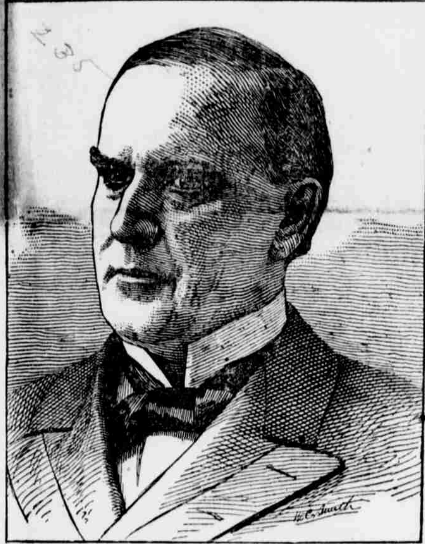
PRESIDENT-ELECT WILLIAM M. MCKINLEY.