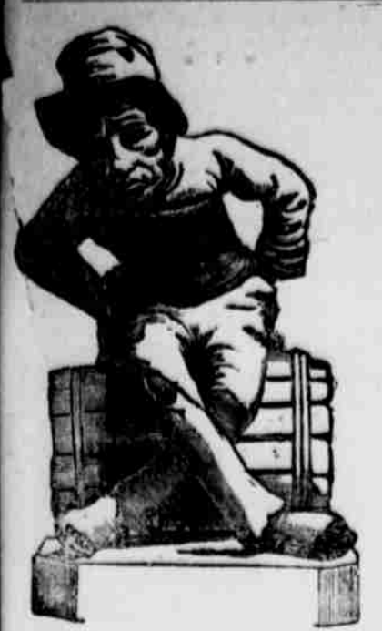
Em Cleveland Si Badreebed Leedle.