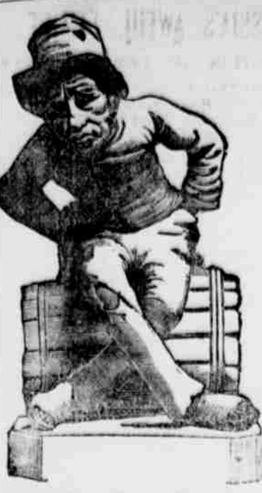
Brief Fum Hausa Barrick