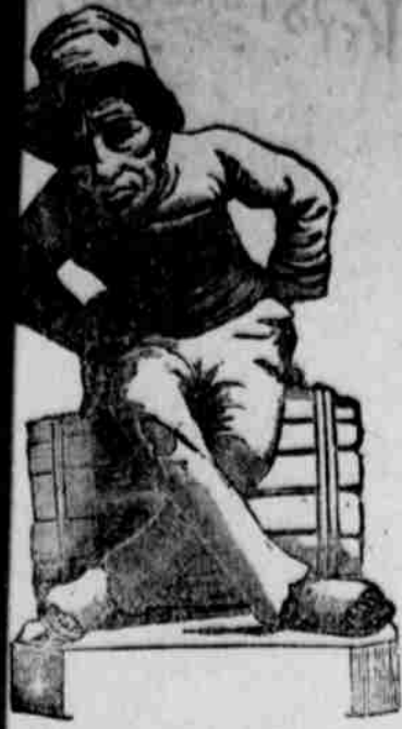
Brief Fum Hausa Barrick