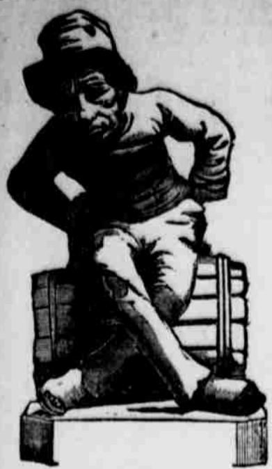
Brief Fum Hausa Barrick.