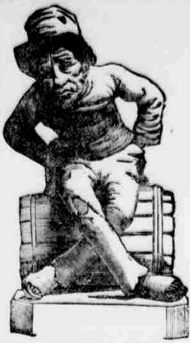
Brief Fum Hausa Barick.